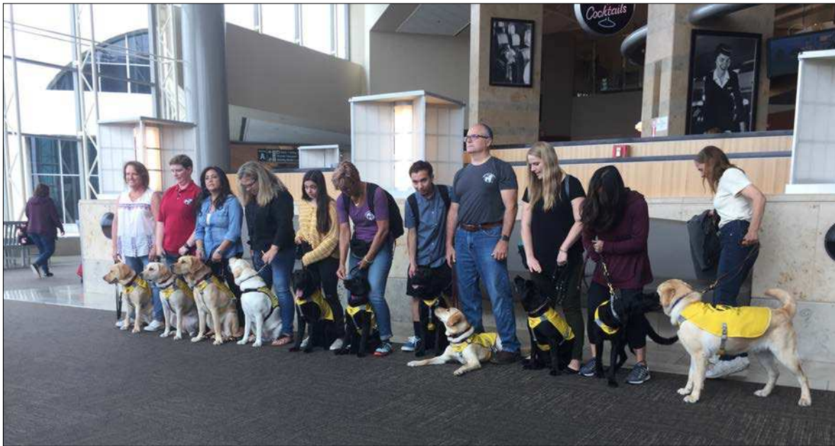
We practiced our loose-leash heeling throughout the airport terminal and got smiles wherever we walked!