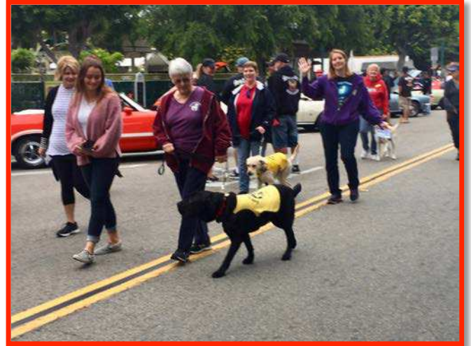
This gave us a chance to practice our loose-leash walking through the closed off street.