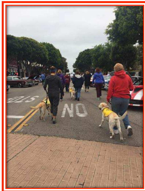
Can you spot me? I'm in front of the word "No."