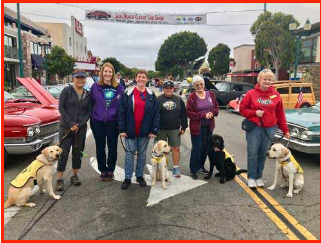
There was a classic car show going on as well as the pancake breakfast.

On April 27th I went to a special outing with some of my GDA friends. We went to the Lion's Club Pancake Breakfast in Seal Beach. One of the Lion's Club's global causes is vision. They serve to prevent avoidable blindness and improve quality of life for people who are blind and visually impaired. It was a great mix-up of two service organizations – Lion's Club and Guide Dogs of America – both dedicated to helping individuals who have visual impairments.