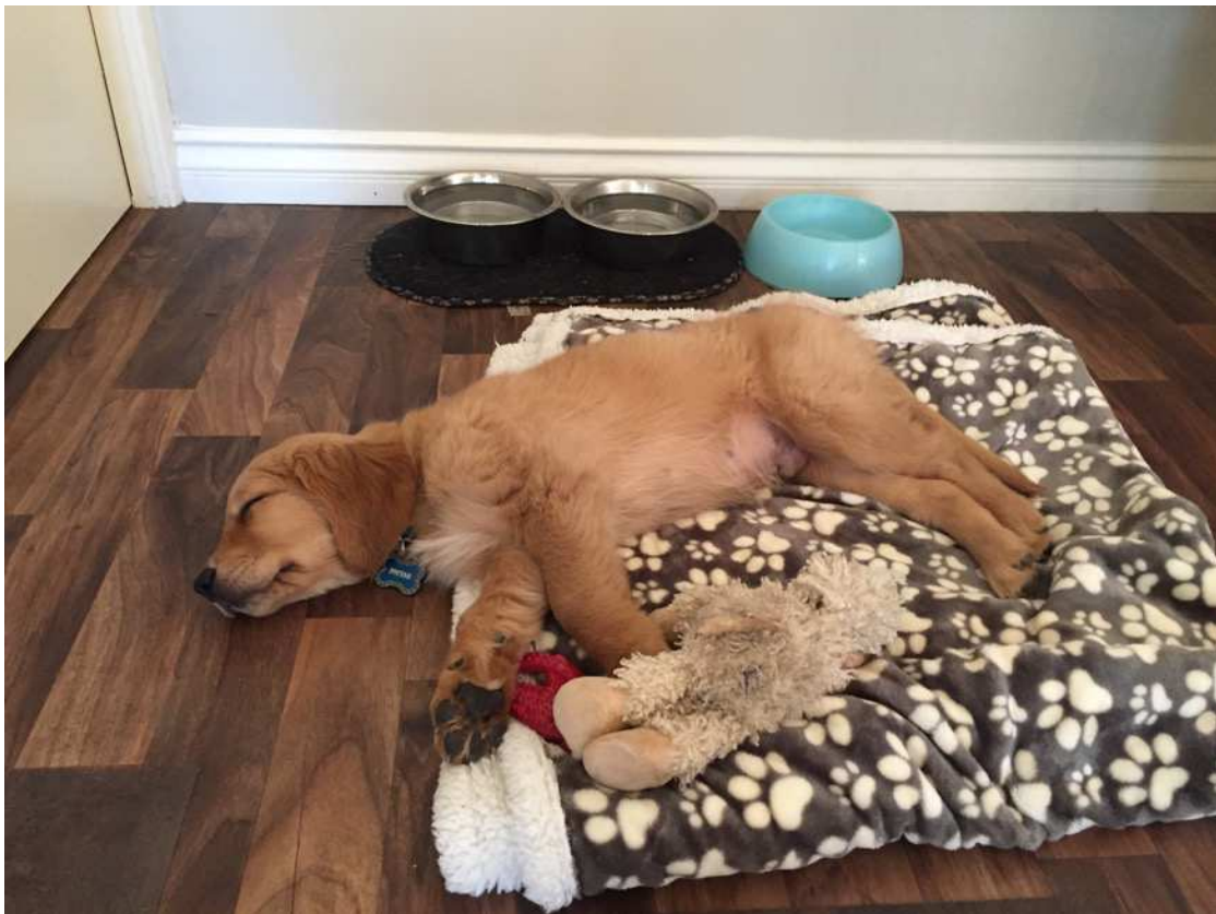
I kinda sleep..... a lot..... ZzZzzZzzzzz....