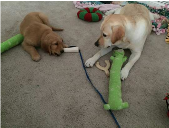
Playing with my “sister” Holland! She is 14 months old and is also a puppy in training like me! She is a great mentor!