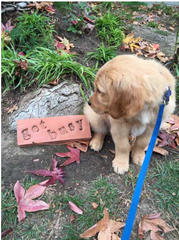
You want me to do what!?